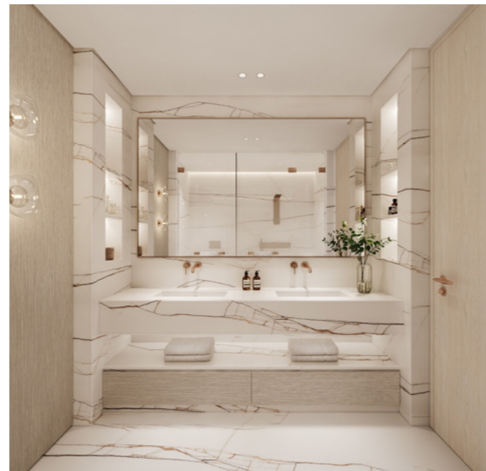
The artist representations and interior decorations, finishes, appliances and furnishings are provided for illustrative purposes only. The developer reserves the right to substitute materials, appliances, equipment, fixtures and other construction and design details specified. The use of any designations, labels or nomenclature is for marketing purposes only. (06.2024)